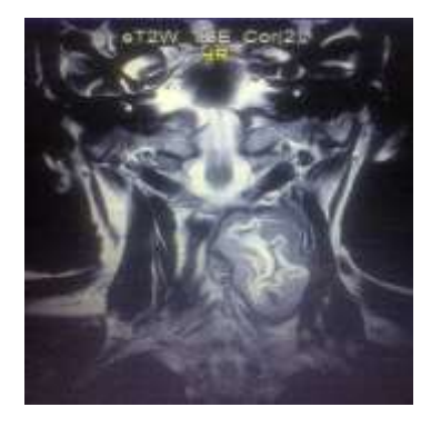
T2WI coronal image