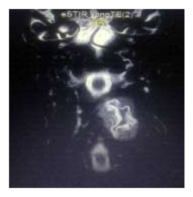
STIR coronal image