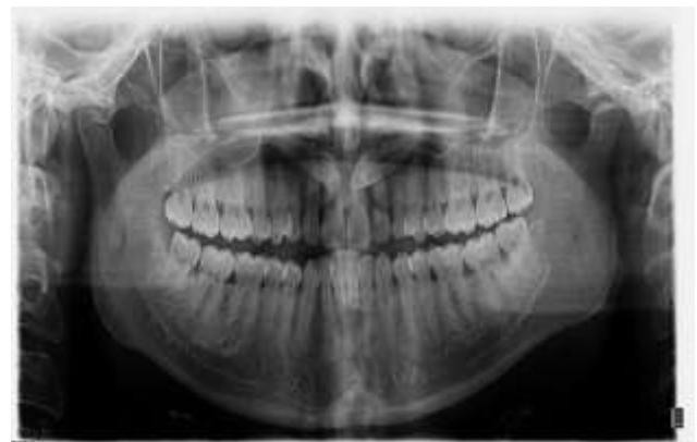
Figure 1: Panoramic radiographs shows us bilateral impacted maxillary canines

unclear radiographs and patient with history of orthodontic treatment.