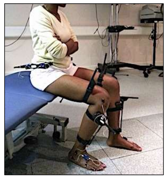
Figure 2: Knee extensor moment assessment during SitTS and StandTS (AS-D condition)