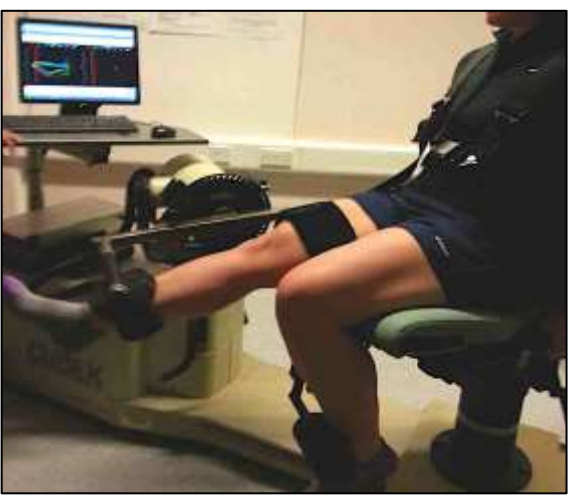
Figure 1: Isokinetic knee moment assessment

studies investigated its validity or reliability in Sit-Stand-Sit.