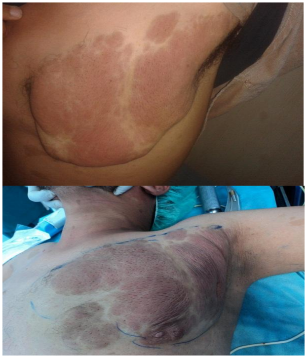
Figure 1: Shows subcutaneous mass which feels like a "bag of worms" (neurofibromas).

Ultrasound for both breast and axilla reveal BIRADS I. He underwent an excisional biopsy of the left breast neurofibromatosis [Fig 3]and the defect was closed by rotation flap. Post-operative period passed smoothly [Fig 4]. Patient confirmed the diagnosis on histological grounds.