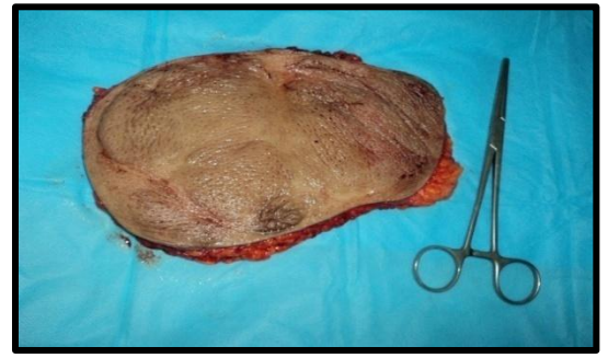
Figure 3:neurofibroma of 20x14x2.5 cm